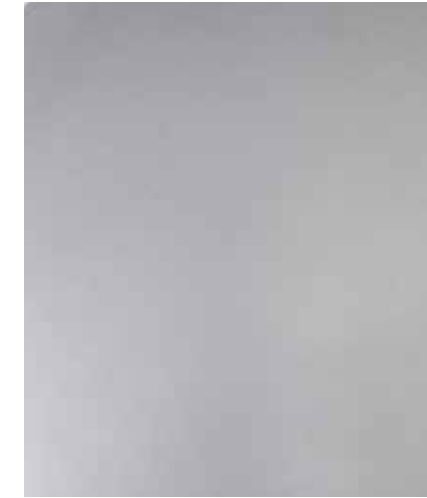
SAND BLASTED STEEL

To clean, use lukewarm water mixed with one drop of olive oil. Do not use any cleaners or other products than olive oil and do not use any other objects than a soft cloth.