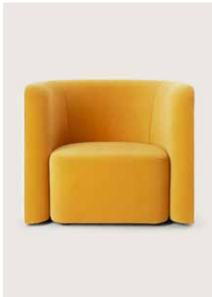
TAKU LOUNGE CHAIR