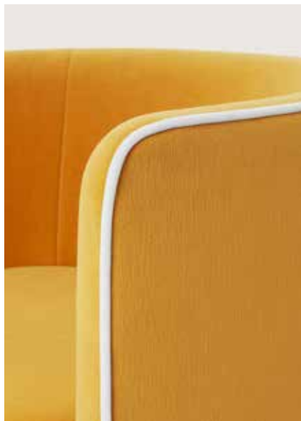
TAKU LOUNGE CHAIR