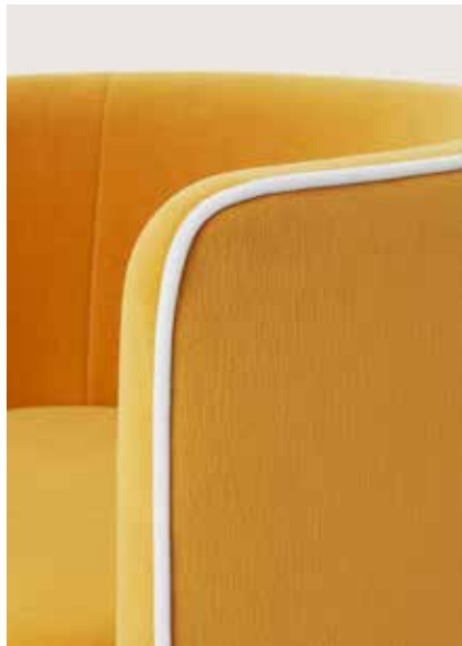
TAKU LOUNGE CHAIR