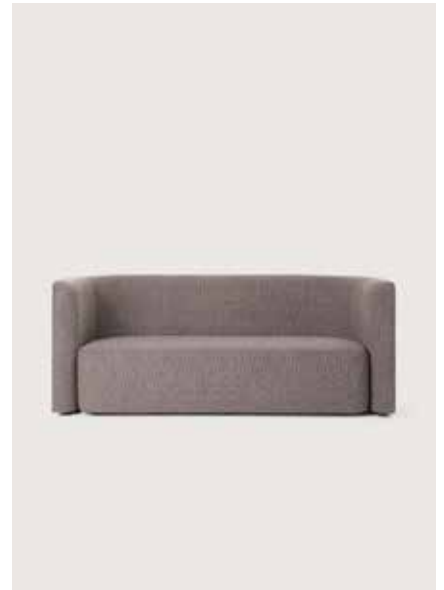
TAKU LOUNGE SOFA