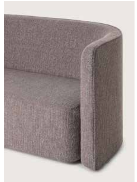
TAKU LOUNGE SOFA