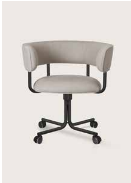
FONT SWIVEL/WHEELS DINING ARMCHAIR