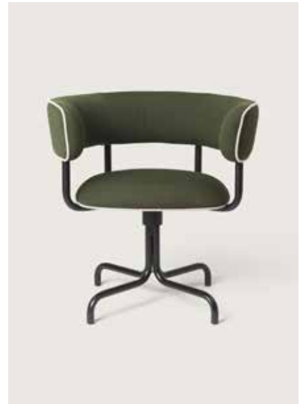
FONT SWIVEL DINING ARMCHAIR