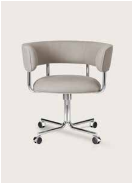
FONT SWIVEL/WHEELS DINING ARMCHAIR