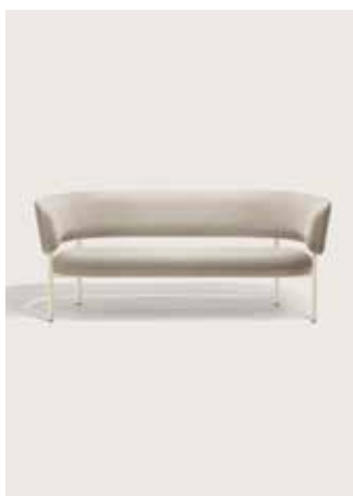
FONT LOUNGE SOFA