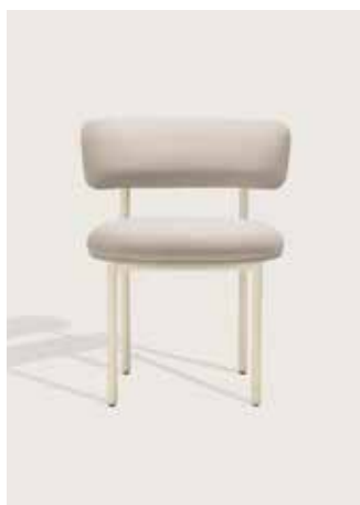
FONT DINING CHAIR