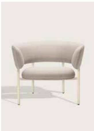
FONT LOUNGE ARMCHAIR