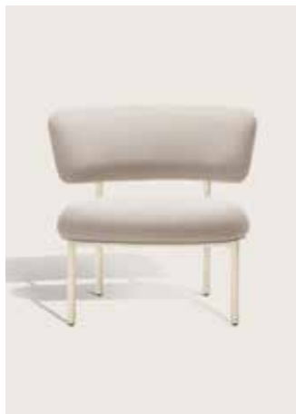
FONT LOUNGE CHAIR