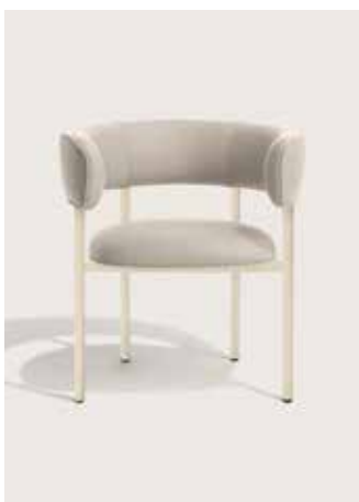
FONT DINING ARMCHAIR