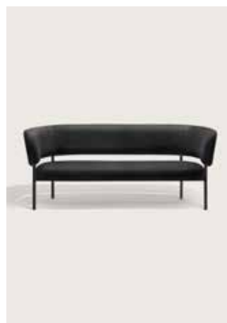
FONT LOUNGE SOFA