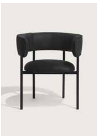
FONT DINING ARMCHAIR