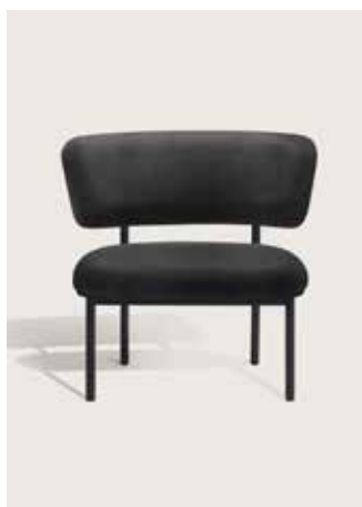
FONT LOUNGE CHAIR