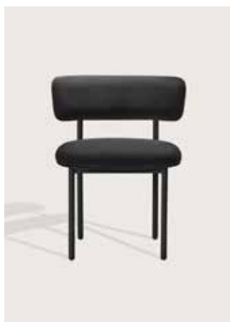
FONT DINING CHAIR