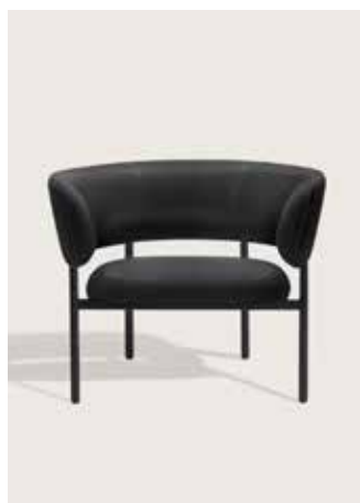
FONT LOUNGE ARMCHAIR