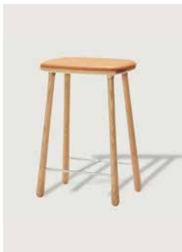
Frame: Olied oak Seat: Sand leather