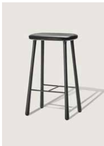
Frame: Black lacquered oak Seat: Black leather