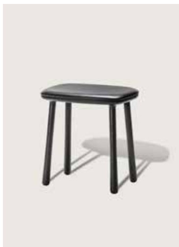
Frame: Black lacquered oak Seat: Black leather