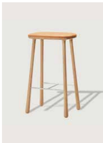
Frame: Olied oak Seat: Sand leather