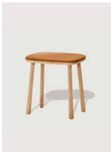
Frame: Olied oak Seat: Cognac leather