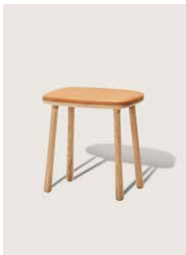
Frame: Olied oak Seat: Sand leather