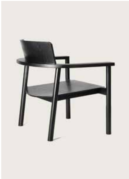
RUDI LOUNGE ARMCHAIR