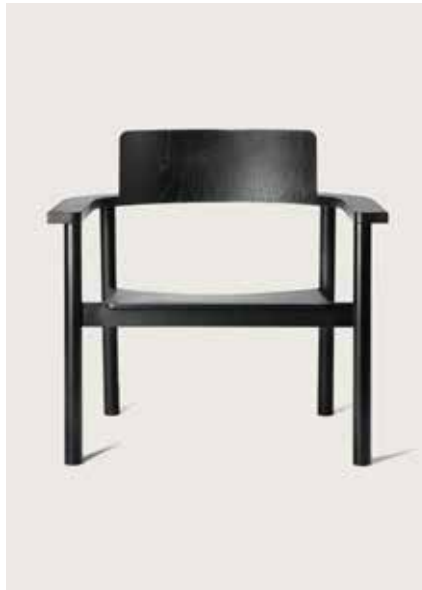
RUDI LOUNGE ARMCHAIR