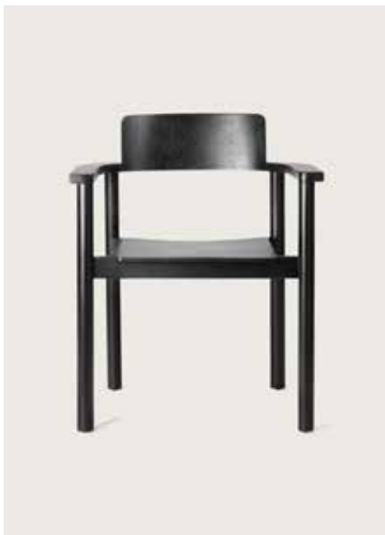
RUDI DINING ARMCHAIR