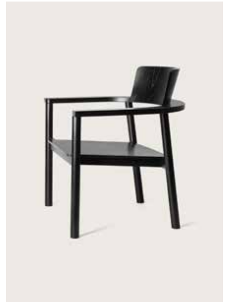
RUDI LOUNGE ARMCHAIR