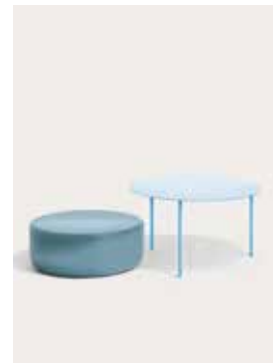
Ceramic: Pastel blue (RAL 5024) Metal: Pastel blue (RAL 5024) or Metal: Sand blasted steel