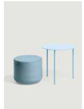
Ceramic: Pastel blue (RAL 5024) Metal: Pastel blue (RAL 5024) or Metal: Sand blasted steel