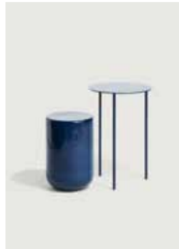
Ceramic: Steel blue (RAL 5011) Metal: Steel blue (RAL 5011) or Metal: Sand blasted steel