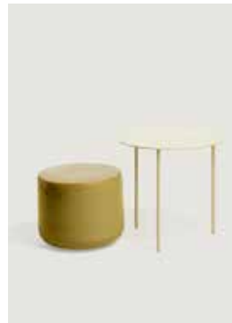
Ceramic: Ochre (RAL 1020) Metal: Ochre (RAL 1020) or Metal: Sand blasted steel