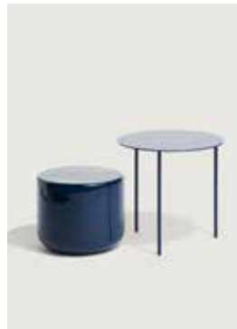
Ceramic: Steel blue (RAL 5011) Metal: Steel blue (RAL 5011) or Metal: Sand blasted steel