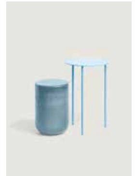
Ceramic: Pastel blue (RAL 5024) Metal: Pastel blue (RAL 5024) or Metal: Sand blasted steel