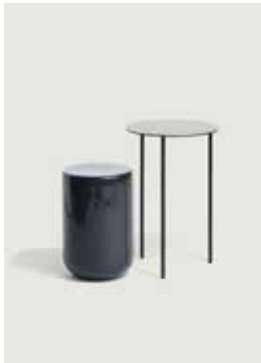
Ceramic: Black (RAL 9005) Metal: Black (RAL 9005) or Metal: Sand blasted steel