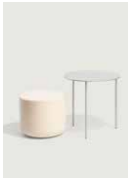
Ceramic: Light ivory (RAL 1015) Metal: Sand blasted metal or Metal: Light ivory (RAL 1015)