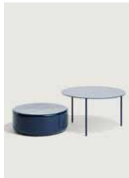
Ceramic: Steel blue (RAL 5011) Metal: Steel blue (RAL 5011) or Metal: Sand blasted steel