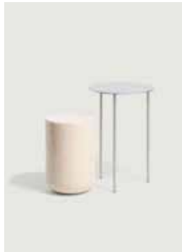
Ceramic: Light ivory (RAL 1015) Metal: Sand blasted metal or Metal: Light ivory (RAL 1015)