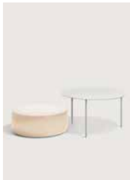
Ceramic: Light ivory (RAL 1015) Metal: Sand blasted metal or Metal: Light ivory (RAL 1015)