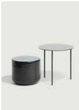
Ceramic: Black (RAL 9005) Metal: Black (RAL 9005) or Metal: Sand blasted steel