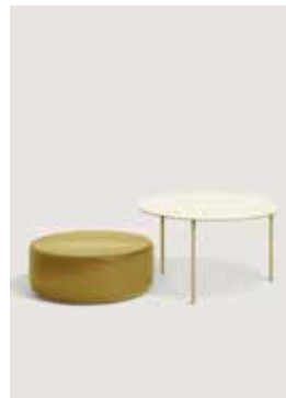
Ceramic: Ochre (RAL 1020) Metal: Ochre (RAL 1020) or Metal: Sand blasted steel