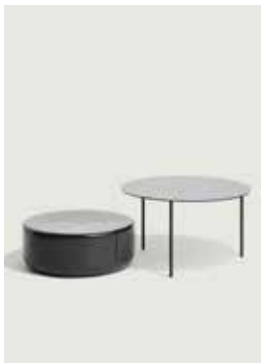
Ceramic: Black (RAL 9005) Metal: Black (RAL 9005) or Metal: Sand blasted steel