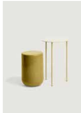
Ceramic: Ochre (RAL 1020) Metal: Ochre (RAL 1020) or Metal: Sand blasted steel