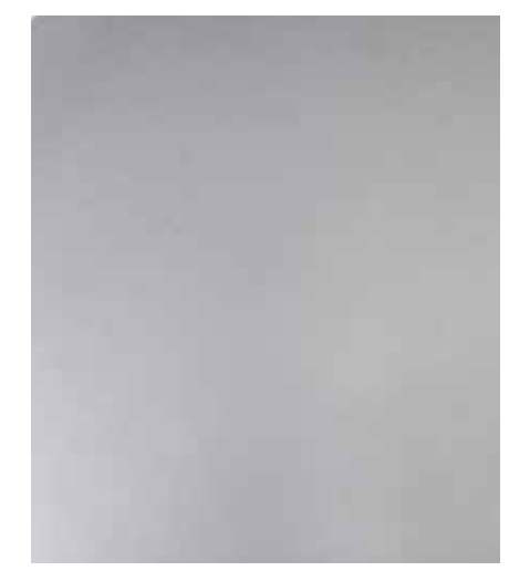
SAND BLASTED STEEL

To clean, simply wipe with a soft cloth using lukewarm water. Avoid the use of chemical cleaners.