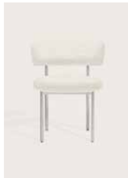
Upholstery: Nevotex Barnum off white Piping: White leather Frame: Polished steel, white or black