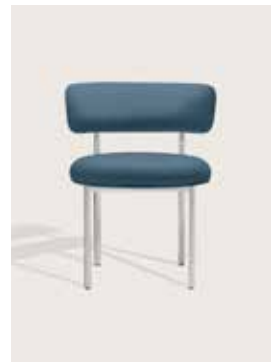
Upholstery: Kvadrat Vidar 733 Piping: Kvadrat Vidar 733 Frame: Polished steel, white or black