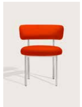
Upholstery: Kvadrat Gentle 553 Piping: Kvadrat Gentle 553 Frame: Polished steel, white or black