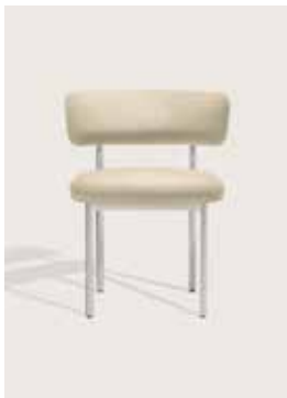
Upholstery: DG Velutto stretto natural Piping: DG Velutto stretto natural Frame: Polished steel, white or black