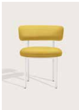
Upholstery: Kvadrat Hallingdal 65 407 Piping: Kvadrat Hallingdal 65 407 Frame: Polished steel, white or black