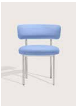
Upholstery: Kvadrat Divina 676 Piping: Kvadrat Divina 676 Frame: Polished steel, white or black