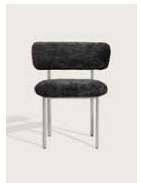
Upholstery: Sheepskin grey Piping: None Frame: Polished steel, white or black