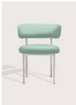
Upholstery: Gabriel Gaja c2c 68090 Piping: Gabriel Gaja c2c 68090 Frame: Polished steel, white or black