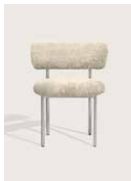
Upholstery: Sheepskin oyster Piping: None Frame: Polished steel, white or black