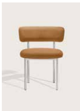
Upholstery: Sørensen Dunes cognac Piping: Sørensen Dunes cognac Frame: Polished steel, white or black