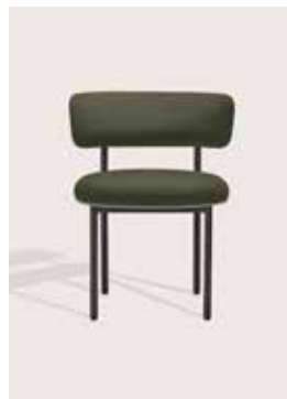
Upholstery: Kvadrat Vidar 972 Piping: Kvadrat Vidar 222 Frame: Polished steel, white or black