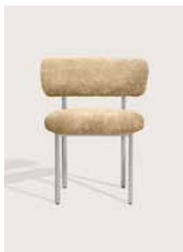
Upholstery: Sheepskin honey Piping: None Frame: Polished steel, white or black