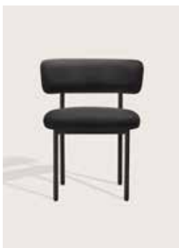
Upholstery: Sørensen Dunes anthrazite Piping: Sørensen Dunes anthrazite Frame: Polished steel, white or black