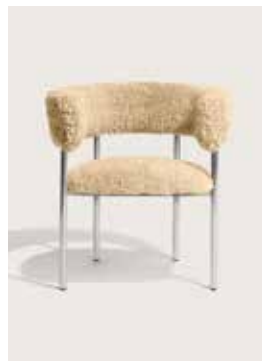
Upholstery: Sheepskin honey Piping: None Frame: Polished steel, white or black