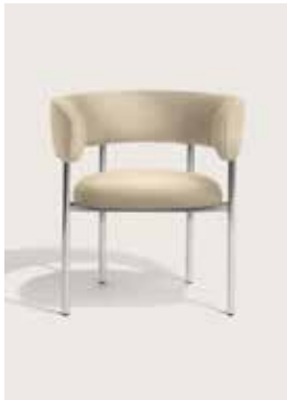
Upholstery: DG Velutto stretto natural Piping: DG Velutto stretto natural Frame: Polished steel, white or black