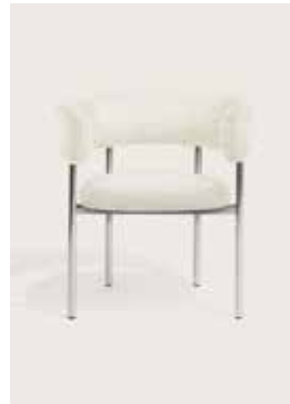
Upholstery: Nevotex Barnum off white Piping: White leather Frame: Polished steel, white or black