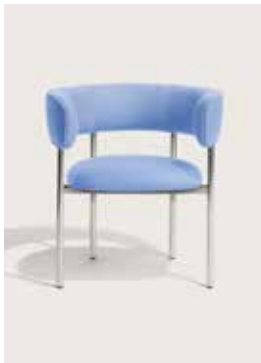
Upholstery: Kvadrat Divina 676 Piping: Kvadrat Divina 676 Frame: Polished steel, white or black