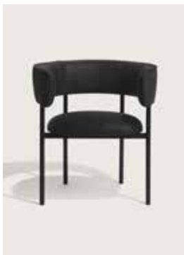
Upholstery: Sørensen Dunes anthrazite Piping: Sørensen Dunes anthrazite Frame: Polished steel, white or black