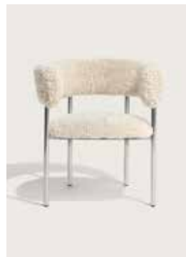
Upholstery: Sheepskin oyster Piping: None Frame: Polished steel, white or black