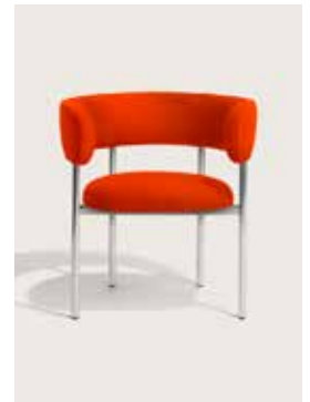
Upholstery: Kvadrat Gentle 553 Piping: Kvadrat Gentle 553 Frame: Polished steel, white or black