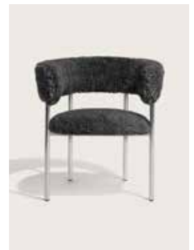
Upholstery: Sheepskin grey Piping: None Frame: Polished steel, white or black