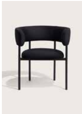
Upholstery: Gabriel Gaja c2c 60999 Piping: Gabriel Gaja c2c 60999 Frame: Polished steel, white or black