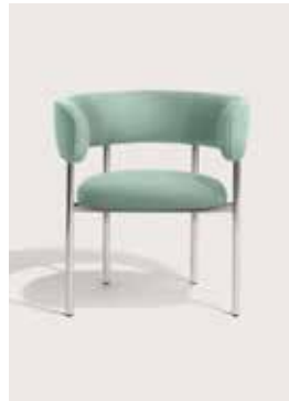
Upholstery: Gabriel Gaja c2c 68090 Piping: Gabriel Gaja c2c 68090 Frame: Polished steel, white or black