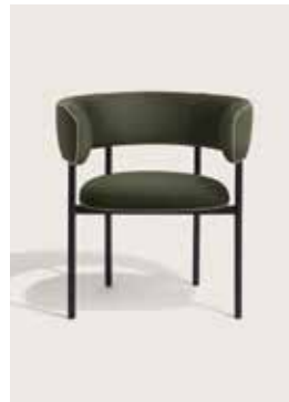
Upholstery: Kvadrat Vidar 972 Piping: Kvadrat Vidar 222 Frame: Polished steel, white or black