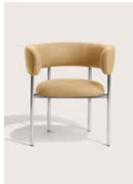
Upholstery: Kvadrat Vidar 323 Piping: Kvadrat Vidar 323 Frame: Polished steel, white or black