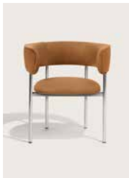
Upholstery: Sørensen Dunes cognac Piping: Sørensen Dunes cognac Frame: Polished steel, white or black