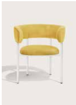
Upholstery: Kvadrat Hallingdal 65 407 Piping: Kvadrat Hallingdal 65 407 Frame: Polished steel, white or black