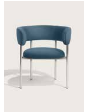
Upholstery: Kvadrat Vidar 733 Piping: Kvadrat Vidar 733 Frame: Polished steel, white or black