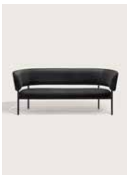
Upholstery: Sørensen Dunes anthrazite Piping: Sørensen Dunes anthrazite Frame: Polished steel, white or black