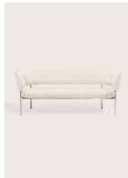
Upholstery: Nevotex Barnum off white Piping: White leather Frame: Polished steel, white or black