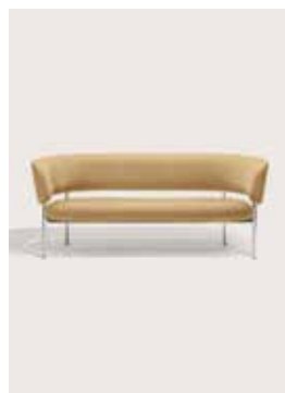
Upholstery: Sheepskin honey Piping: None Frame: Polished steel, white or black