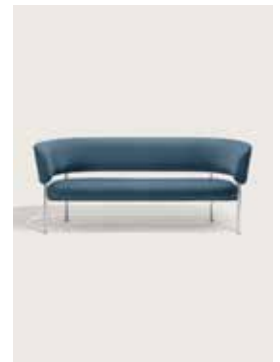
Upholstery: Kvadrat Vidar 733 Piping: Kvadrat Vidar 733 Frame: Polished steel, white or black