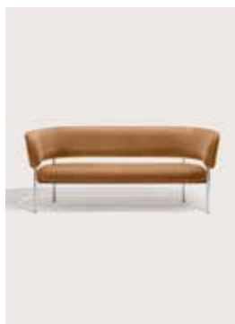
Upholstery: Sørensen Dunes cognac Piping: Sørensen Dunes cognac Frame: Polished steel, white or black