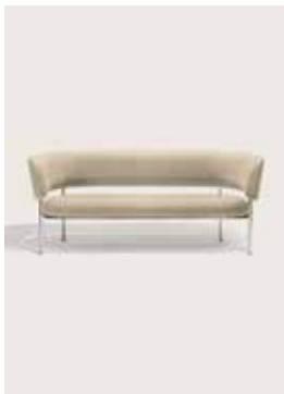
Upholstery: DG Velutto stretto natural Piping: DG Velutto stretto natural Frame: Polished steel, white or black