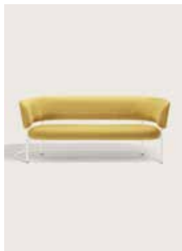
Upholstery: Kvadrat Hallingdal 65 407 Piping: Kvadrat Hallingdal 65 407 Frame: Polished steel, white or black