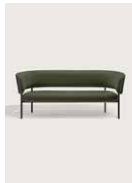
Upholstery: Kvadrat Vidar 972 Piping: Kvadrat Vidar 222 Frame: Polished steel, white or black