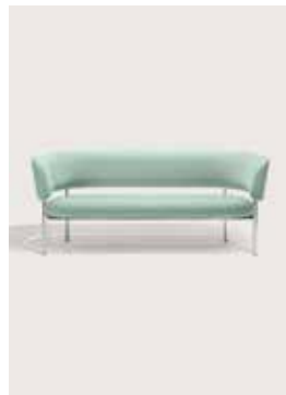
Upholstery: Gabriel Gaja c2c 68090 Piping: Gabriel Gaja c2c 68090 Frame: Polished steel, white or black