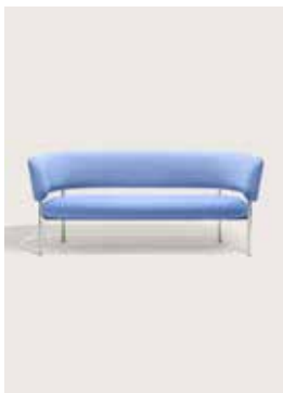
Upholstery: Kvadrat Divina 676 Piping: Kvadrat Divina 676 Frame: Polished steel, white or black