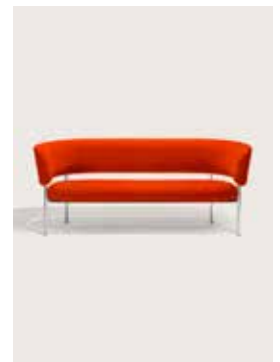
Upholstery: Kvadrat Gentle 553 Piping: Kvadrat Gentle 553 Frame: Polished steel, white or black