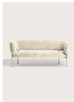
Upholstery: Sheepskin oyster Piping: None Frame: Polished steel, white or black