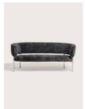
Upholstery: Sheepskin grey Piping: None Frame: Polished steel, white or black