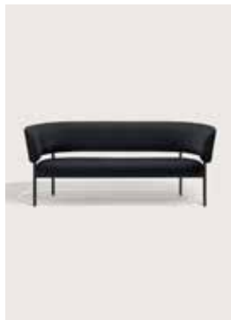
Upholstery: Gabriel Gaja c2c 60999 Piping: Gabriel Gaja c2c 60999 Frame: Polished steel, white or black