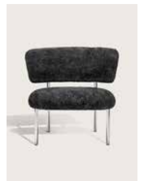
Upholstery: Sheepskin grey Piping: None Frame: Polished steel, white or black