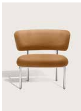
Upholstery: Sørensen Dunes cognac Piping: Sørensen Dunes cognac Frame: Polished steel, white or black