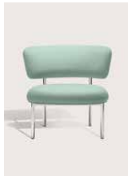
Upholstery: Gabriel Gaja c2c 68090 Piping: Gabriel Gaja c2c 68090 Frame: Polished steel, white or black