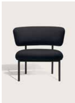
Upholstery: Gabriel Gaja c2c 60999 Piping: Gabriel Gaja c2c 60999 Frame: Polished steel, white or black