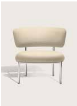
Upholstery: DG Velutto stretto natural Piping: DG Velutto stretto natural Frame: Polished steel, white or black