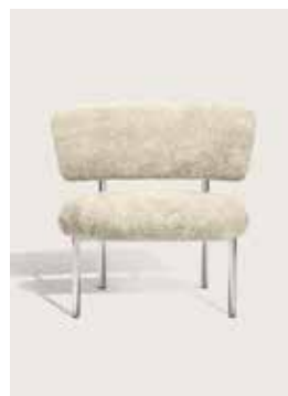
Upholstery: Sheepskin oyster Piping: None Frame: Polished steel, white or black