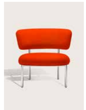
Upholstery: Kvadrat Gentle 553 Piping: Kvadrat Gentle 553 Frame: Polished steel, white or black