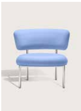
Upholstery: Kvadrat Divina 676 Piping: Kvadrat Divina 676 Frame: Polished steel, white or black