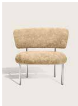
Upholstery: Sheepskin honey Piping: None Frame: Polished steel, white or black