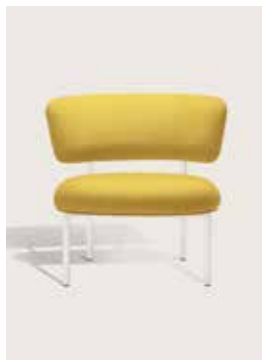
Upholstery: Kvadrat Hallingdal 65 407 Piping: Kvadrat Hallingdal 65 407 Frame: Polished steel, white or black