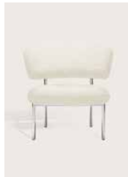
Upholstery: Nevotex Barnum off white Piping: White leather Frame: Polished steel, white or black