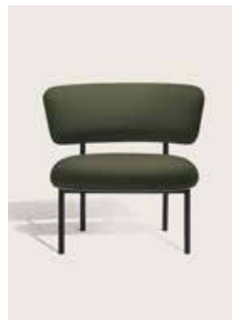
Upholstery: Kvadrat Vidar 972 Piping: Kvadrat Vidar 222 Frame: Polished steel, white or black