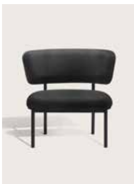
Upholstery: Sørensen Dunes anthrazite Piping: Sørensen Dunes anthrazite Frame: Polished steel, white or black