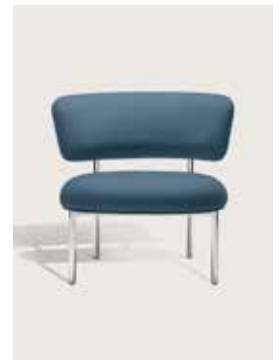
Upholstery: Kvadrat Vidar 733 Piping: Kvadrat Vidar 733 Frame: Polished steel, white or black