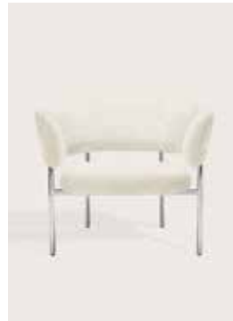
Upholstery: Nevotex Barnum off white Piping: White leather Frame: Polished steel, white or black