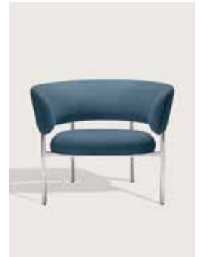
Upholstery: Kvadrat Vidar 733 Piping: Kvadrat Vidar 733 Frame: Polished steel, white or black