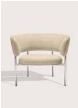
Upholstery: DG Velutto stretto natural Piping: DG Velutto stretto natural Frame: Polished steel, white or black