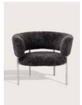
Upholstery: Sheepskin grey Piping: None Frame: Polished steel, white or black