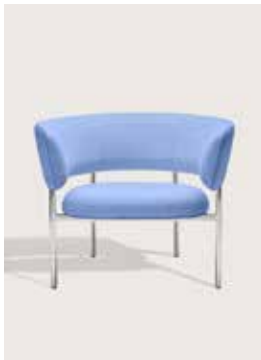
Upholstery: Kvadrat Divina 676 Piping: Kvadrat Divina 676 Frame: Polished steel, white or black