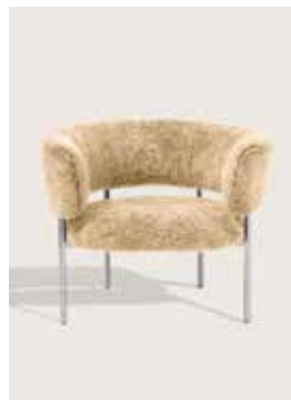
Upholstery: Sheepskin honey Piping: None Frame: Polished steel, white or black