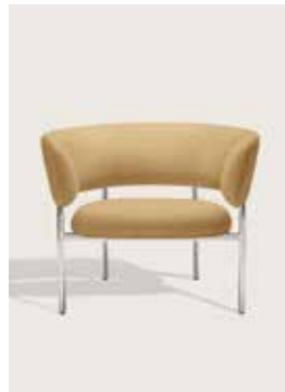
Upholstery: Kvadrat Vidar 323 Piping: Kvadrat Vidar 323 Frame: Polished steel, white or black