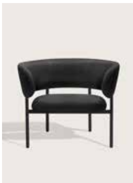
Upholstery: Sørensen Dunes anthrazite Piping: Sørensen Dunes anthrazite Frame: Polished steel, white or black