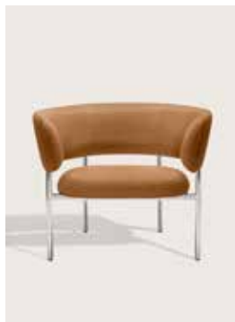
Upholstery: Sørensen Dunes cognac Piping: Sørensen Dunes cognac Frame: Polished steel, white or black