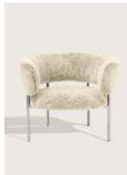
Upholstery: Sheepskin oyster Piping: None Frame: Polished steel, white or black