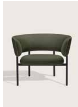
Upholstery: Kvadrat Vidar 972 Piping: Kvadrat Vidar 222 Frame: Polished steel, white or black