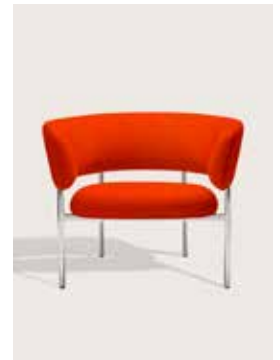
Upholstery: Kvadrat Gentle 553 Piping: Kvadrat Gentle 553 Frame: Polished steel, white or black