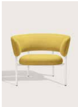
Upholstery: Kvadrat Hallingdal 65 407 Piping: Kvadrat Hallingdal 65 407 Frame: Polished steel, white or black