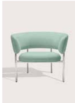
Upholstery: Gabriel Gaja c2c 68090 Piping: Gabriel Gaja c2c 68090 Frame: Polished steel, white or black