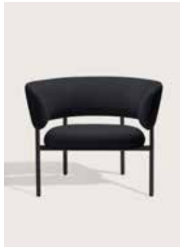
Upholstery: Gabriel Gaja c2c 60999 Piping: Gabriel Gaja c2c 60999 Frame: Polished steel, white or black