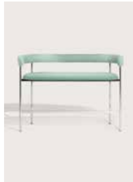
Upholstery: Gabriel Gaja c2c 68090 Piping: Gabriel Gaja c2c 68090 Frame: Polished steel, white or black