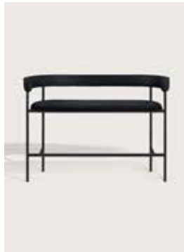
Upholstery: Gabriel Gaja c2c 60999 Piping: Gabriel Gaja c2c 60999 Frame: Polished steel, white or black