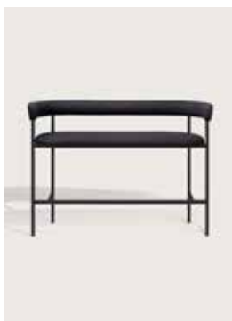
Upholstery: Sørensen Dunes anthrazite Piping: Sørensen Dunes anthrazite Frame: Polished steel, white or black