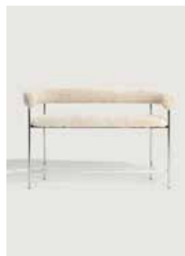
Upholstery: Sheepskin oyster Piping: None Frame: Polished steel, white or black