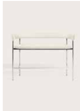
Upholstery: Nevotex Barnum off white Piping: White leather Frame: Polished steel, white or black