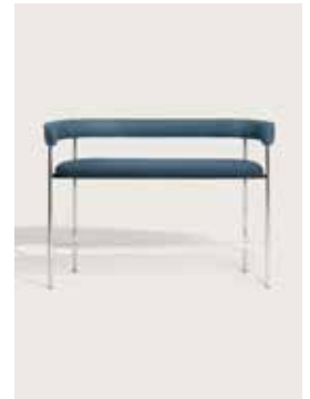
Upholstery: Kvadrat Vidar 733 Piping: Kvadrat Vidar 733 Frame: Polished steel, white or black