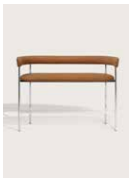
Upholstery: Sørensen Dunes cognac Piping: Sørensen Dunes cognac Frame: Polished steel, white or black