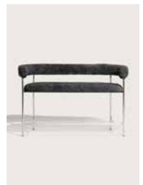
Upholstery: Sheepskin grey Piping: None Frame: Polished steel, white or black