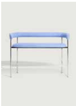
Upholstery: Kvadrat Divina 676 Piping: Kvadrat Divina 676 Frame: Polished steel, white or black