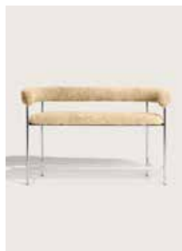
Upholstery: Sheepskin honey Piping: None Frame: Polished steel, white or black