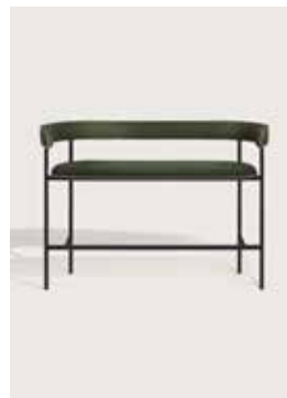
Upholstery: Kvadrat Vidar 972 Piping: Kvadrat Vidar 222 Frame: Polished steel, white or black