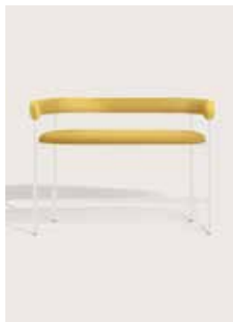
Upholstery: Kvadrat Hallingdal 65 407 Piping: Kvadrat Hallingdal 65 407 Frame: Polished steel, white or black