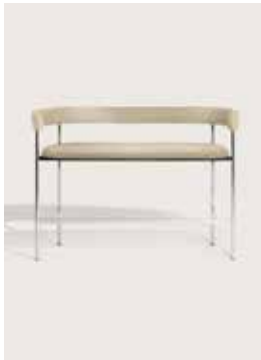
Upholstery: DG Velutto stretto natural Piping: DG Velutto stretto natural Frame: Polished steel, white or black