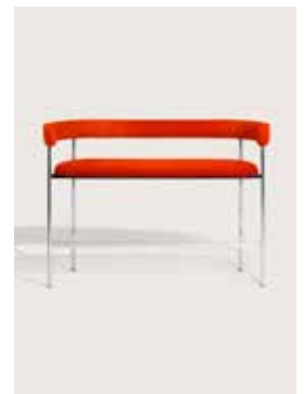
Upholstery: Kvadrat Gentle 553 Piping: Kvadrat Gentle 553 Frame: Polished steel, white or black