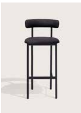
Upholstery: Sørensen Dunes anthrazite Piping: Sørensen Dunes anthrazite Frame: Polished steel, white or black