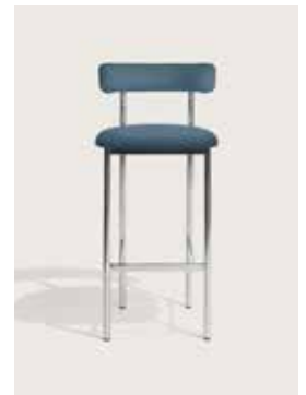
Upholstery: Kvadrat Vidar 733 Piping: Kvadrat Vidar 733 Frame: Polished steel, white or black