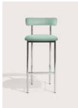
Upholstery: Gabriel Gaja c2c 68090 Piping: Gabriel Gaja c2c 68090 Frame: Polished steel, white or black