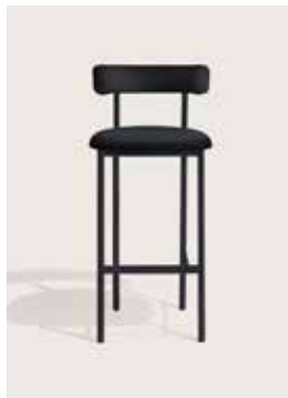
Upholstery: Gabriel Gaja c2c 60999 Piping: Gabriel Gaja c2c 60999 Frame: Polished steel, white or black