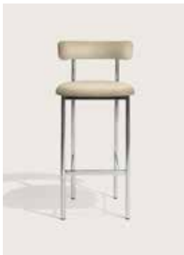
Upholstery: DG Velutto stretto natural Piping: DG Velutto stretto natural Frame: Polished steel, white or black