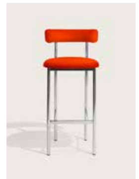
Upholstery: Kvadrat Gentle 553 Piping: Kvadrat Gentle 553 Frame: Polished steel, white or black