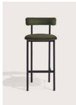
Upholstery: Kvadrat Vidar 972 Piping: Kvadrat Vidar 222 Frame: Polished steel, white or black