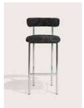
Upholstery: Sheepskin grey Piping: None Frame: Polished steel, white or black