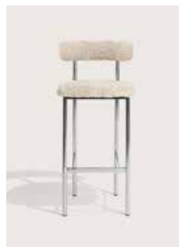
Upholstery: Sheepskin oyster Piping: None Frame: Polished steel, white or black