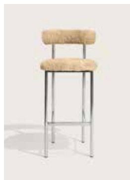
Upholstery: Sheepskin honey Piping: None Frame: Polished steel, white or black