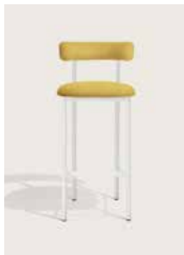
Upholstery: Kvadrat Hallingdal 65 407 Piping: Kvadrat Hallingdal 65 407 Frame: Polished steel, white or black