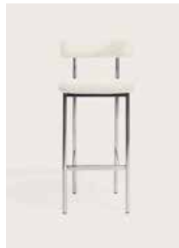
Upholstery: Nevotex Barnum off white Piping: White leather Frame: Polished steel, white or black