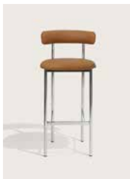
Upholstery: Sørensen Dunes cognac Piping: Sørensen Dunes cognac Frame: Polished steel, white or black