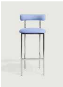
Upholstery: Kvadrat Divina 676 Piping: Kvadrat Divina 676 Frame: Polished steel, white or black