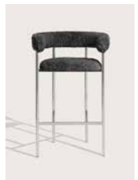
Upholstery: Sheepskin grey Piping: None Frame: Polished steel, white or black