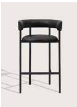
Upholstery: Sørensen Dunes anthrazite Piping: Sørensen Dunes anthrazite Frame: Polished steel, white or black