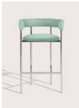
Upholstery: Gabriel Gaja c2c 68090 Piping: Gabriel Gaja c2c 68090 Frame: Polished steel, white or black