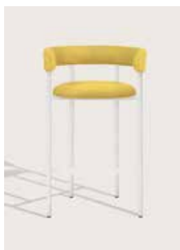
Upholstery: Kvadrat Hallingdal 65 407 Piping: Kvadrat Hallingdal 65 407 Frame: Polished steel, white or black