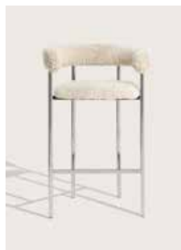
Upholstery: Sheepskin oyster Piping: None Frame: Polished steel, white or black