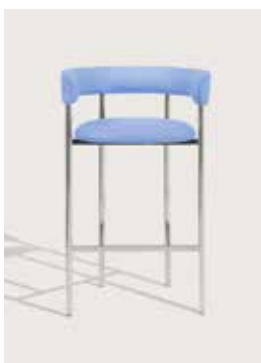
Upholstery: Kvadrat Divina 676 Piping: Kvadrat Divina 676 Frame: Polished steel, white or black