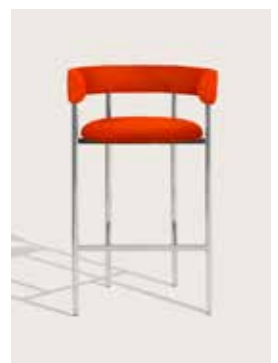
Upholstery: Kvadrat Gentle 553 Piping: Kvadrat Gentle 553 Frame: Polished steel, white or black