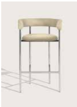
Upholstery: DG Velutto stretto natural Piping: DG Velutto stretto natural Frame: Polished steel, white or black