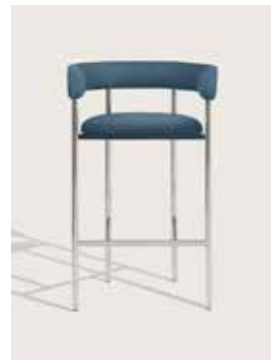
Upholstery: Kvadrat Vidar 733 Piping: Kvadrat Vidar 733 Frame: Polished steel, white or black