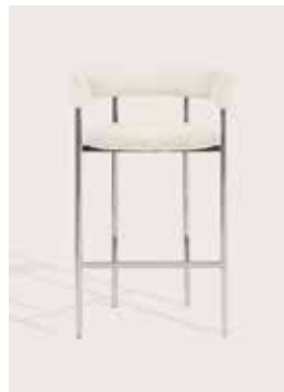
Upholstery: Nevotex Barnum off white Piping: White leather Frame: Polished steel, white or black