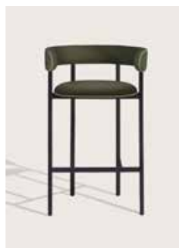
Upholstery: Kvadrat Vidar 972 Piping: Kvadrat Vidar 222 Frame: Polished steel, white or black