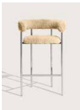
Upholstery: Sheepskin honey Piping: None Frame: Polished steel, white or black