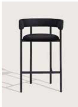
Upholstery: Gabriel Gaja c2c 60999 Piping: Gabriel Gaja c2c 60999 Frame: Polished steel, white or black