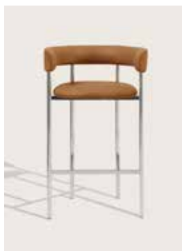
Upholstery: Sørensen Dunes cognac Piping: Sørensen Dunes cognac Frame: Polished steel, white or black