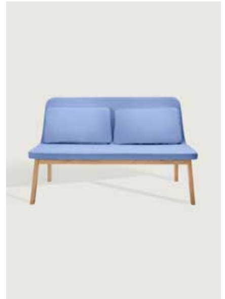
Base: Oiled oak Upholstery: Kvadrat Divina 676