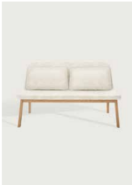
Base: Oiled oak Upholstery: Nevotex Barnum bouclé off white