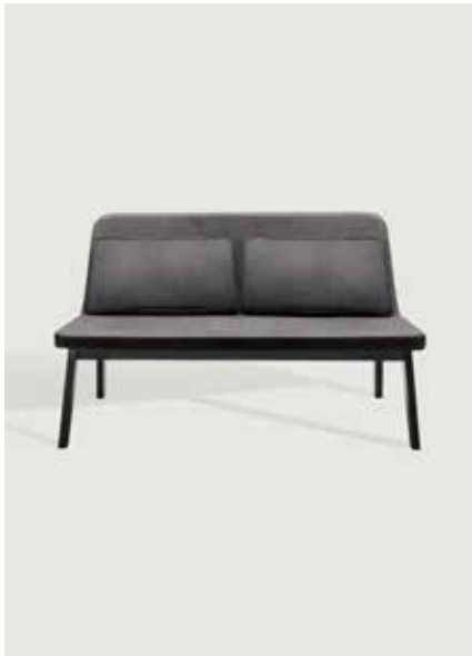
Base: Black lacquered oak Upholstery: Sørensen Dunes anthrazite