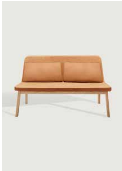
Base: Oiled oak Upholstery: Sørensen Dunes cognac