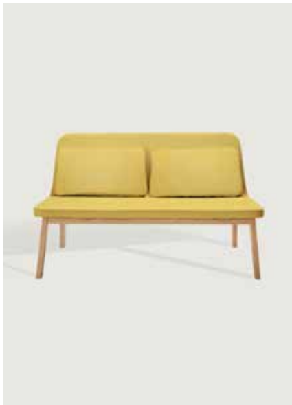
Base: Oiled oak Upholstery: Kvadrat Hallingdal 65 407