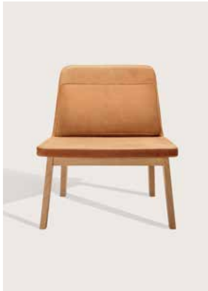
Base: Oiled oak Upholstery: Sørensen Dunes cognac