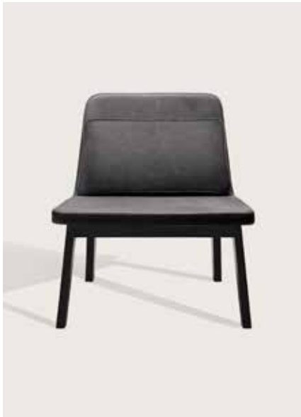
Base: Black lacquered oak Upholstery: Sørensen Dunes anthrazite