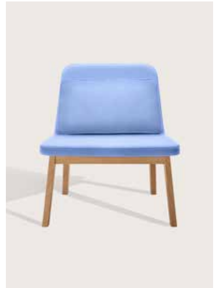
Base: Oiled oak Upholstery: Kvadrat Divina 676