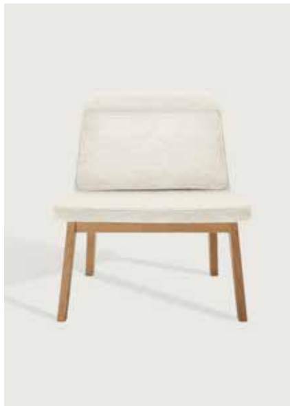
Base: Oiled oak Upholstery: Nevotex Barnum bouclé off white