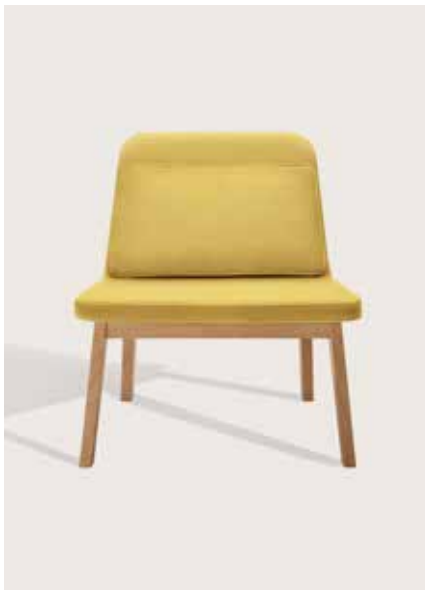
Base: Oiled oak Upholstery: Kvadrat Hallingdal 65 407