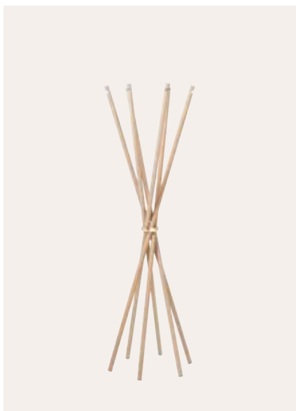
Poles: White oiled ash Ring: Brass