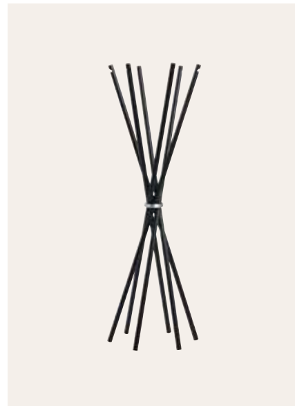
Poles: Black lacquered ash Ring: Polished aluminium