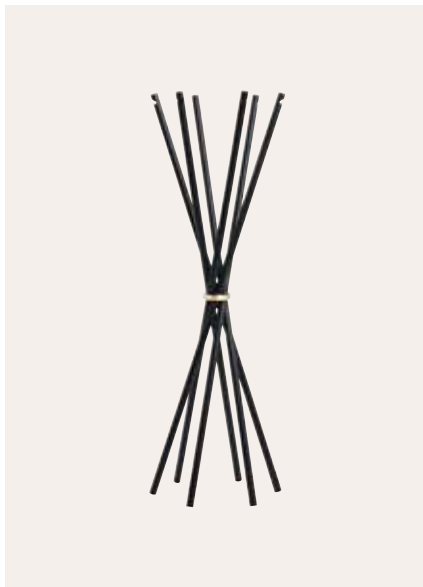
Poles: Black lacquered ash Ring: Brass