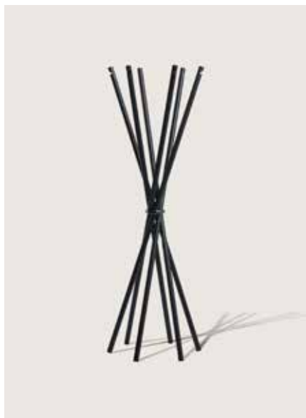
Poles: Black lacquered ash Ring: Satin black