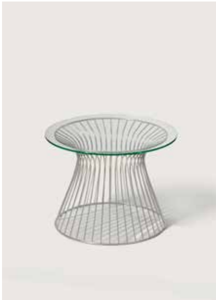
Frame: Galvanized Table top: Clear glass