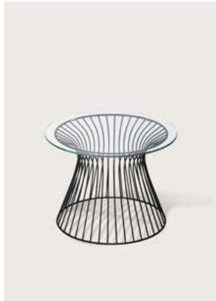
Frame: Black (RAL 9005) Table top: Clear glass