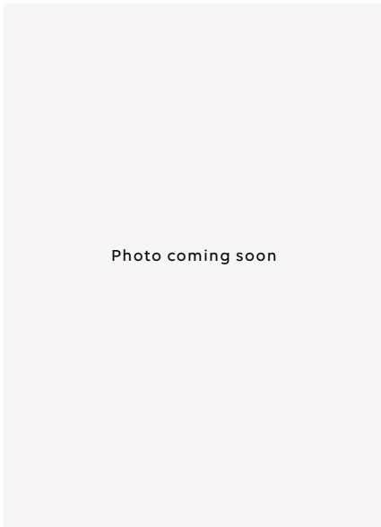
Frame: Galvanized Table top: Anthracite glass