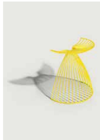
H 46 cm Frame: Yellow (RAL 1018)