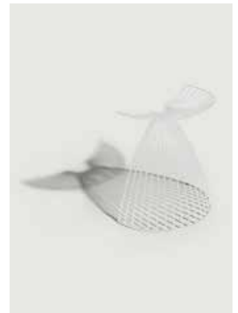
H 46 cm Frame: White (RAL 9010)