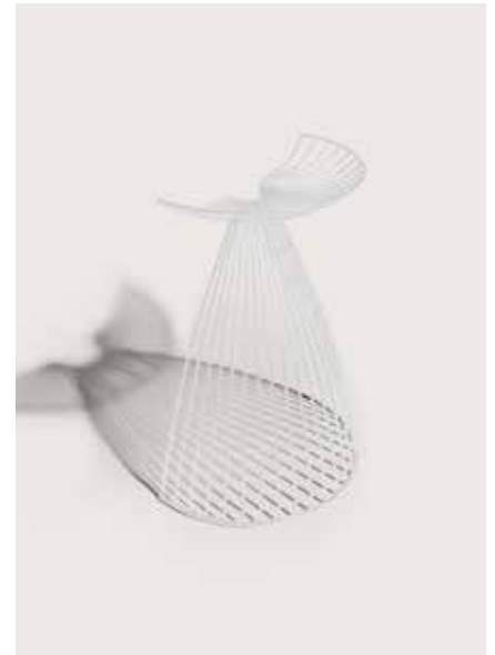
H 66 cm Frame: White (RAL 9010)