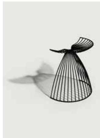
H 46 cm Frame: Black (RAL 9005)