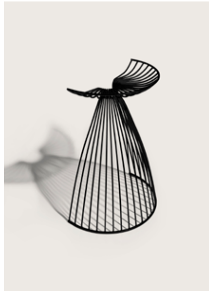
H 66 cm Frame: Black (RAL 9005)