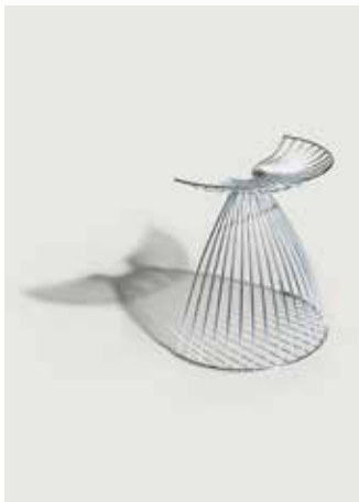
H 46 cm Frame: Galvanized steel