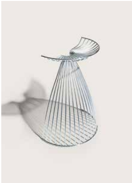
H 66 cm Frame: Galvanized steel